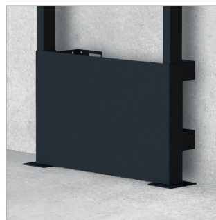
Bolts securely to the floor and wall for permanent installation