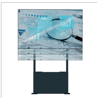
Height adjustment range of 650mm