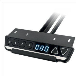
Supplied with a wired remote control